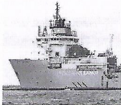
The Ocean Cleanup

GUNDECHA ONCLAVE 1B1 KHERANI RD SAKI NAKA MUMBAI, 89 400072