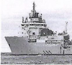
The Ocean Cleanup

GUNDECHA ONCLAVE 1B1 KHERANI RD SAKI NAKA MUMBAI, 89 400072