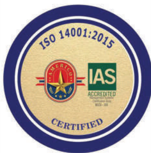
ISO 14001:2015 ENVIRONMENTAL MANAGEMENT SYSTEM