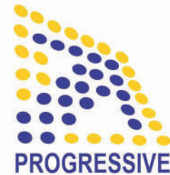
ISO/IEC 27701:2019 PRIVACY INFORMATION MANAGEMENT SYSTEM