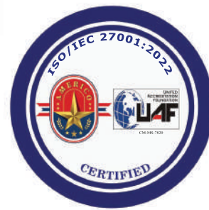
ISO/IEC 27001 : 2022 INFORMATION SECURITY MANAGEMENT SYSTEM