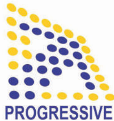
ISO/IEC 23026:2015 SYSTEM AND SOFTWARE ENGINEERING