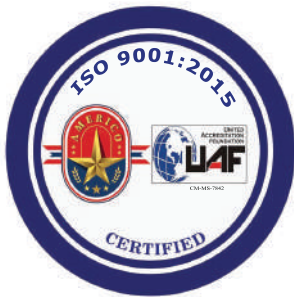
ISO 9001 : 2015 QUALITY MANAGEMENT SYSTEM